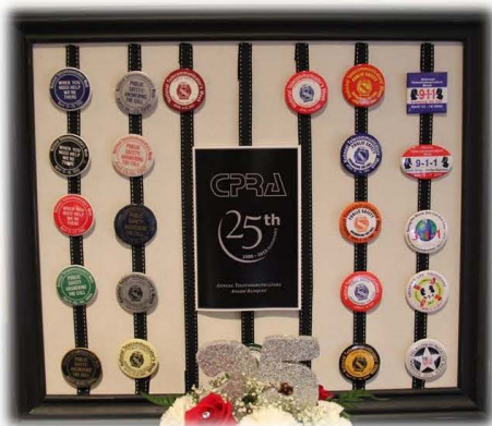
Historical Buttons designed by CPRA