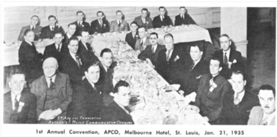
1st Annual Convention, APCO, Melbourne Hotel, St. Louis, Jan. 21, 1935